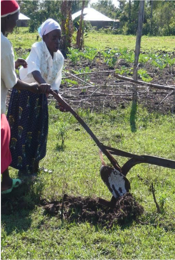
Ox ploughing by women